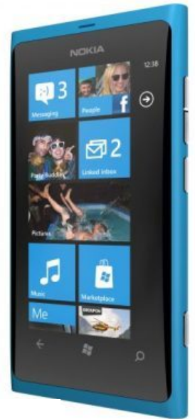
Windows Phone 7